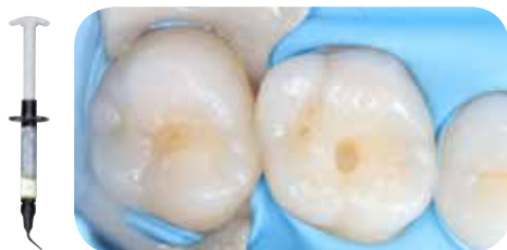
Preparation of the small Class I cavities

Thanks to a proprietary filler treatment and to the use of ultra-fine particles, the physical properties of Essentia HiFlo & Essentia LoFlo are even higher than those of Essentia Universal, confirming that all products can be safely used for all indications.