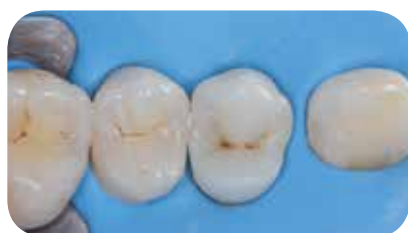
Restoration with everX Posterior as a dentin core and Essentia Universal as the outer shell