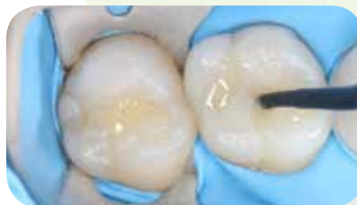
Restoration using Essentia HiFlo Universal