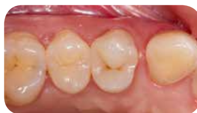
Six-month recall showing good shade integration with the surrounding dental tissues