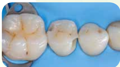
Air abrasion of the non-carious lesions