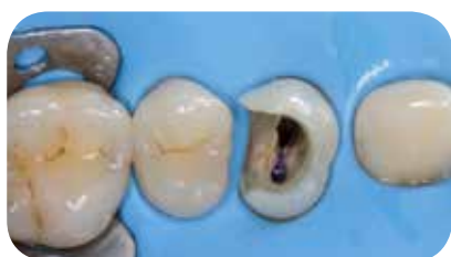
A direct approach was selected for this challenging post-endodontic case