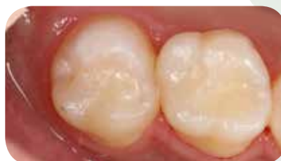
Post-operative view showing a great blending with natural teeth