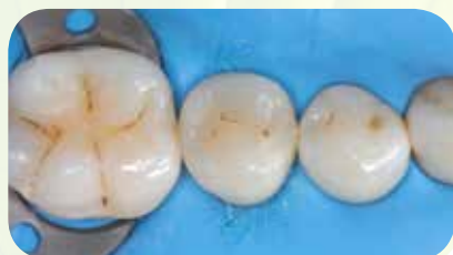
Restoration with Essentia LoFlo Universal