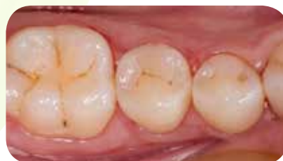
Post-operative view after polishing