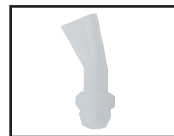
1018359 Ribbon tips for green mixing tips – bite registration