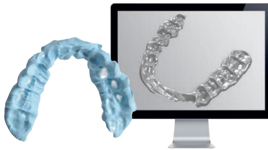
Scan of bite registration made with Imprint 4 Bite material.

3M™ Imprint™ 4 Bite Registration material is a universal VPS bite registration material. The material can also be scanned for occlusal recording and registration with CAD/CAM systems.