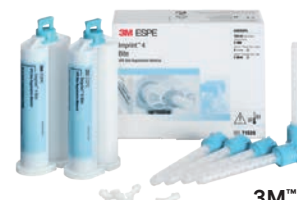
3M™ Imprint™ 4 Bite Refill (71529)