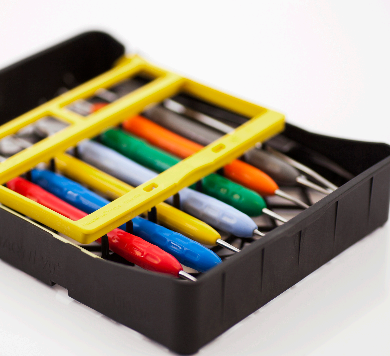
PractiPal® Half Tray