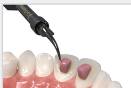
BITE RAMPS & TEMPORARY OCCLUSAL BUILDUPS