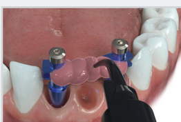
SPLINTING BETWEEN IMPLANT COPINGS